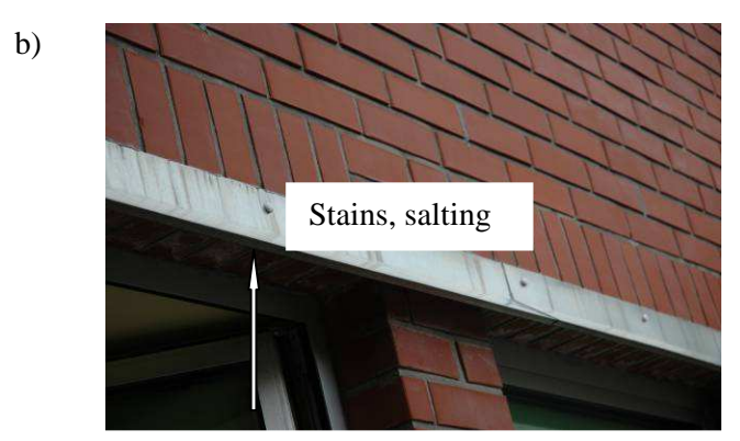
Fig. 1. Setting of window in the three-layer wall; a) view the installed windows from the inside b) the method of attaching aluminium canopies above the windows

Between the window frame and bricks of the protective wall there is no gap comfortable for the setting of windows and then performing the required sealing. This solution is shown in Fig. 1a. It follows that the window frame was a lintel for wall part made above the window. Between flat (smooth) metal and rough, porous brick is no tightness, water penetrates easily. Such a phenomenon